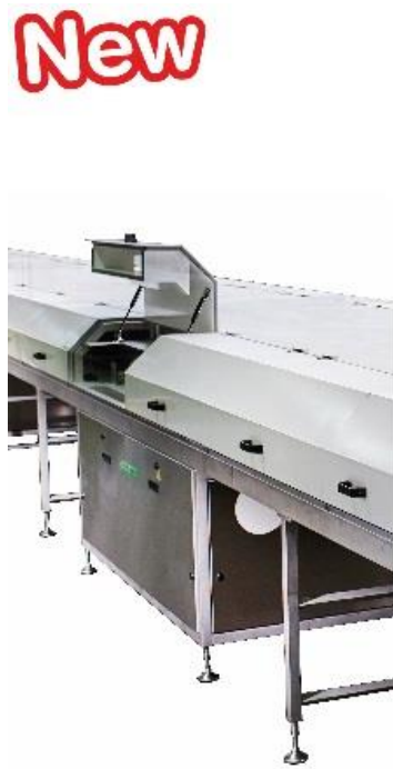
New version Gulf Wing tunnel covers