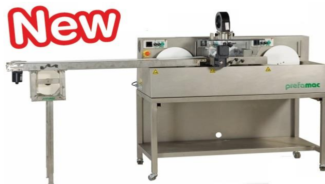
Now also enrobing with the 3in1 machine ....

This enrober belt can also be used for the Compact machine and as table model