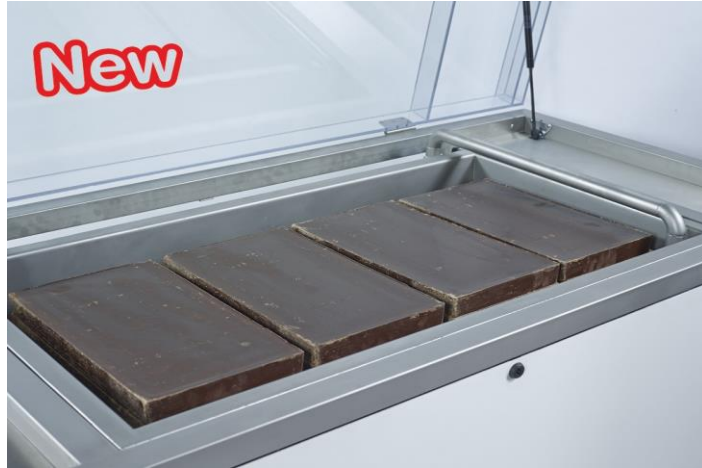
Quick melter for blocks or chocolate drops

F: +32(13)52.18.48 info@prefamac.com www.prefamac.com