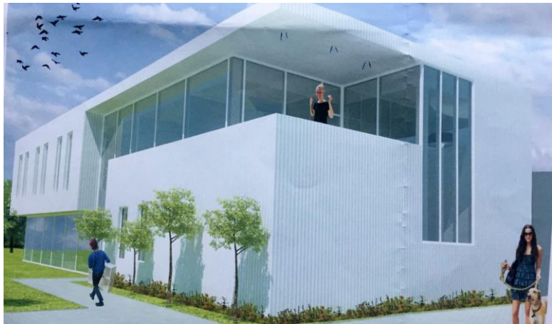
The new construction works have started.