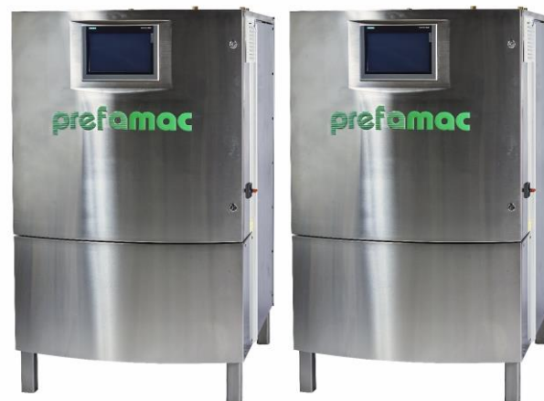
Continuous tempering, standard or energy version