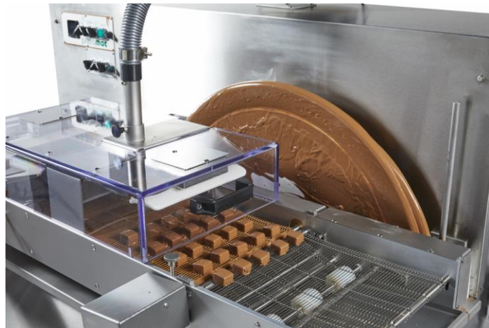
The DLUX enrober belt 28 cm

You still have plenty of time to prepare all of your questions. This is possible until beginning of February 2019, but your appointment should be reserved immediately ! Just send us an email ( info@prefamac.com ) to confirm your interest.